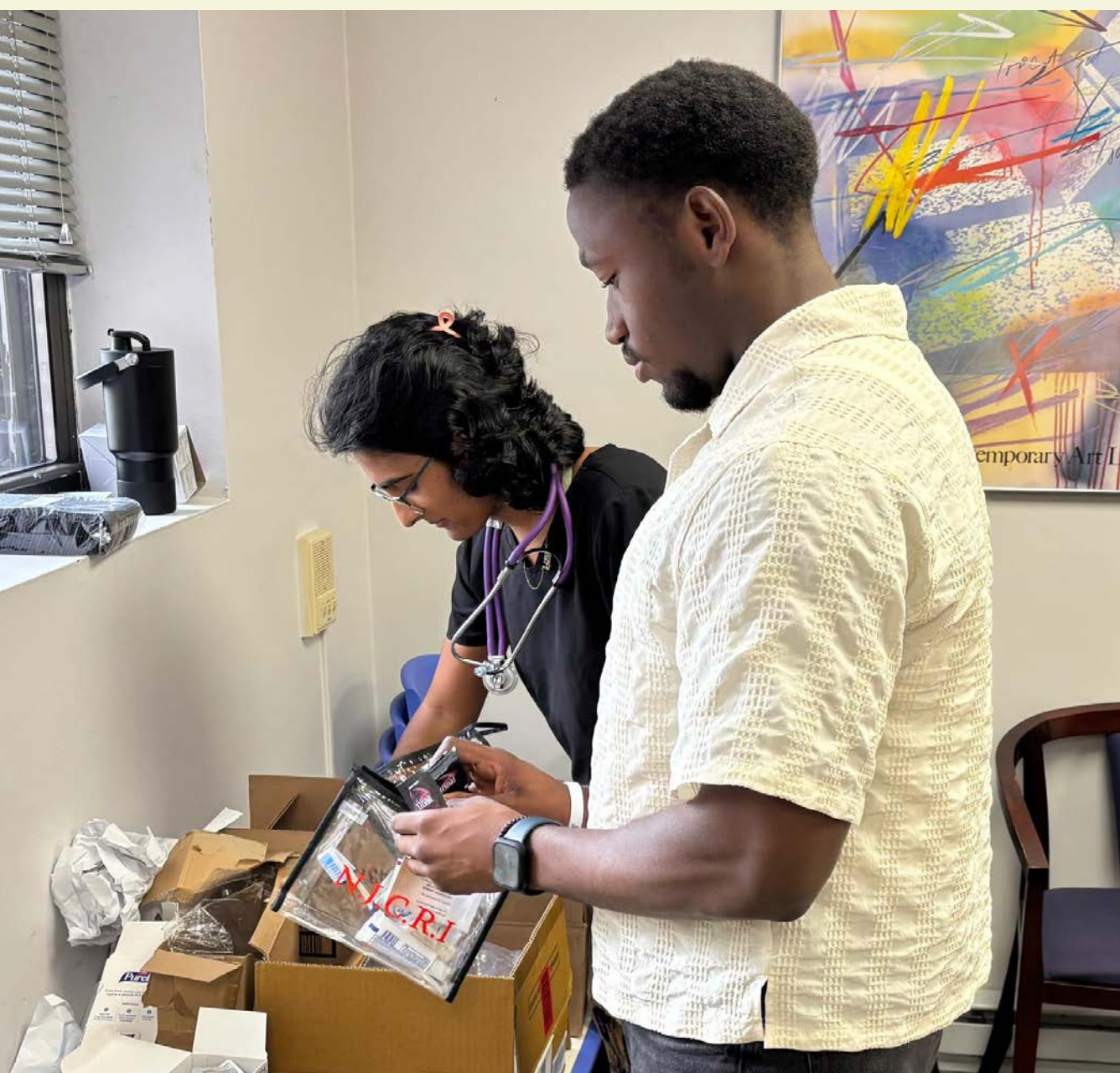
Interns packing bags filled with hygiene items to hand out to community members.

If left untreated, HIV can cause Acquired Immunodeficiency Syndrome, known as AIDs. This means that the immune system of a person who has AIDs is not as strong as a healthy person, which can cause them to get infections that are not common, and experience sickness in a way that is more severe.