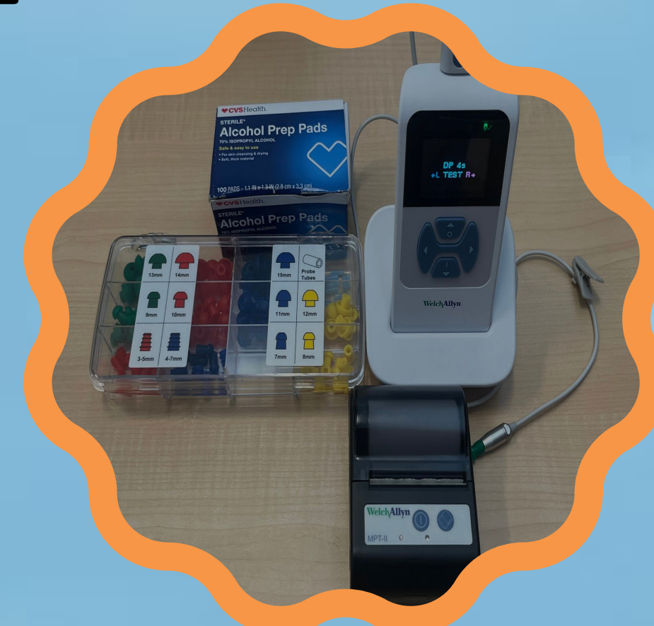
Welch Allyn Hearing Screening