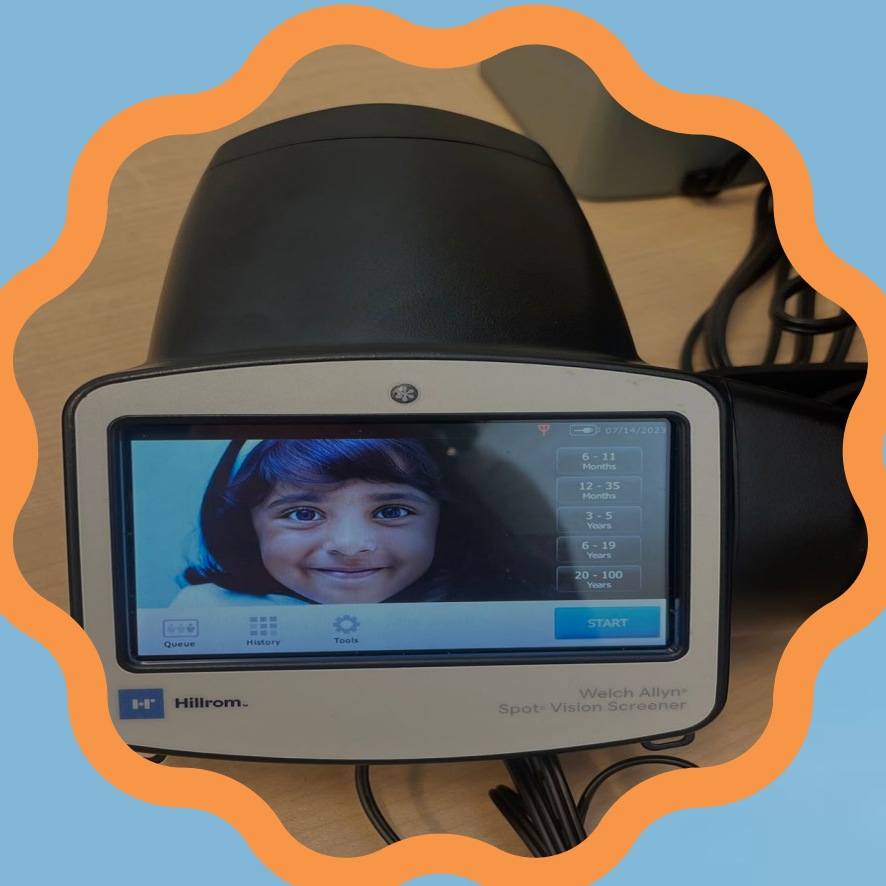
Welch Allyn Vision Screening